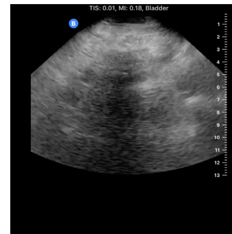
Fig 1. Limited pelvis POCUS exam reveals an empty bladder.